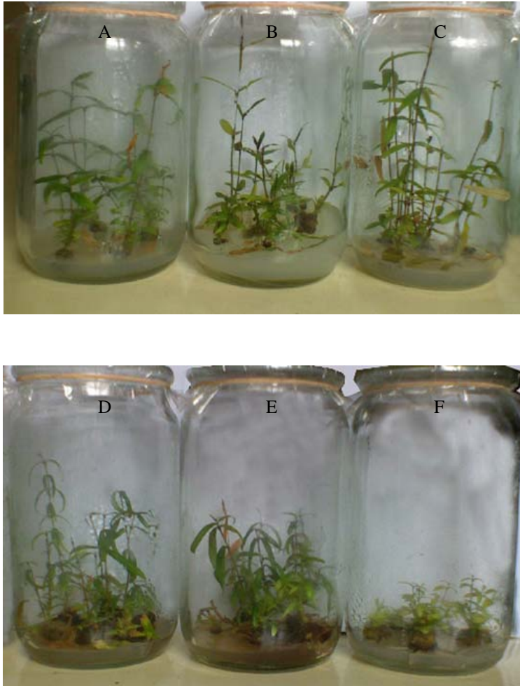
Plate 3. Effect of different concentrations of BAP on shoot induction and multiplication at 6 weeks after 1 st subculturing (A) 0 mg/L BAP + 0.1 mg/L NAA (B) 2 mg/L BAP + 0.1 mg/L NAA (C) 5 mg/L BAP + 0.1 mg/L NAA (D) 10 mg/L BAP + 0.1 mg/L NAA (E) 15 mg/L BAP + 0.1 mg/L NAA (F) 20 mg/L BAP + 0.1 mg/L NAA.