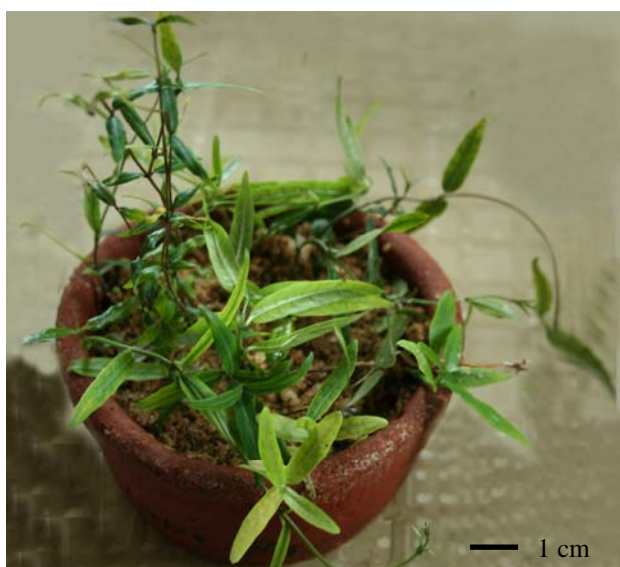
Plate 4. In vitro rooted plantlets of Hemidesmus indicus at the stage of acclimatization.

Note: Data expressed as Mean ± SE from 20 replicates. Within columns, values followed by the same letter are not significantly different at the P = 0.05.